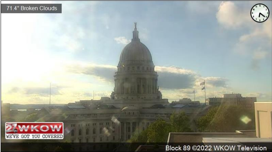
Figure 1 Example of Timelapse Movie with Clock

Videstra offers a feature for Web Published timelapse videos that includes a small clockface that will show the timeframe covered by the timelapse in an interesting and familiar way. The hands are rendered when the timelapse movie is created and move as the movie plays; this way viewers can easily see the time covered by the timelapse movie.